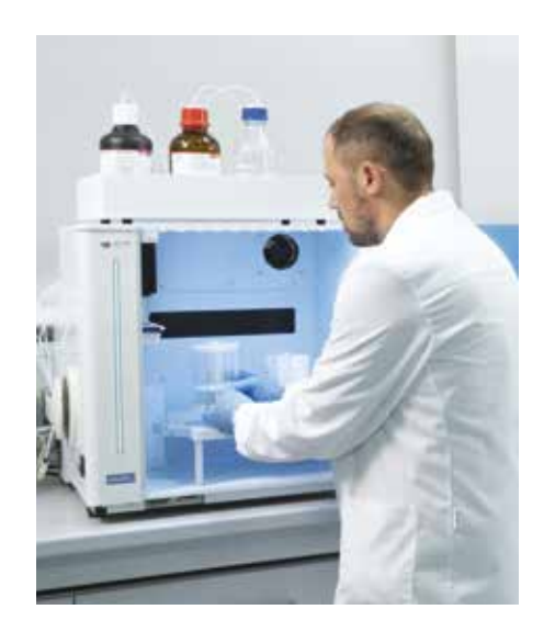
Racks with vessels or vials are placed into the easyFILL

The task of manually adding reagents occupies valuable time of the operator, limiting lab productivity and the ability of the chemist to accomplish other tasks. easyFILL automates these steps, reducing the operator time to just a few seconds.