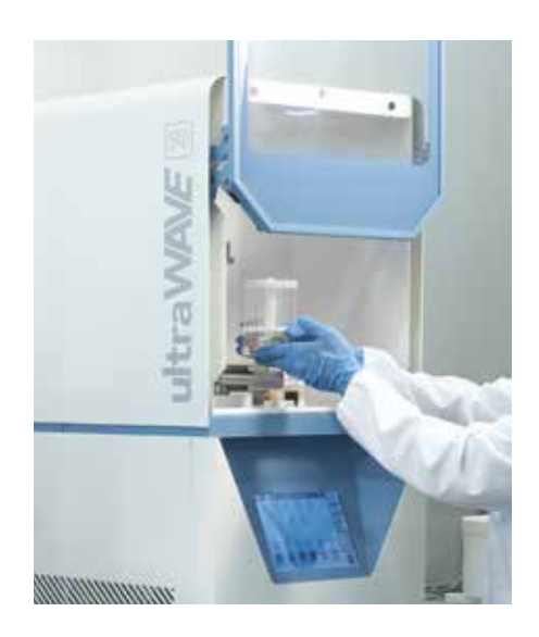
Vessels are ready for the digestion process

Additionally, the easyFILL enables predilution. At the completion of the digestion process, the solutions are transferred into volumetric containers and placed into easyFILL for automatic pre-dilution. This step is commonly done using ICP autosampler vials so that the operator has only to finalise the dilution and bring the solutions to the analytical equipment.