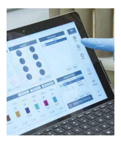
Select the Method and press 'Run'