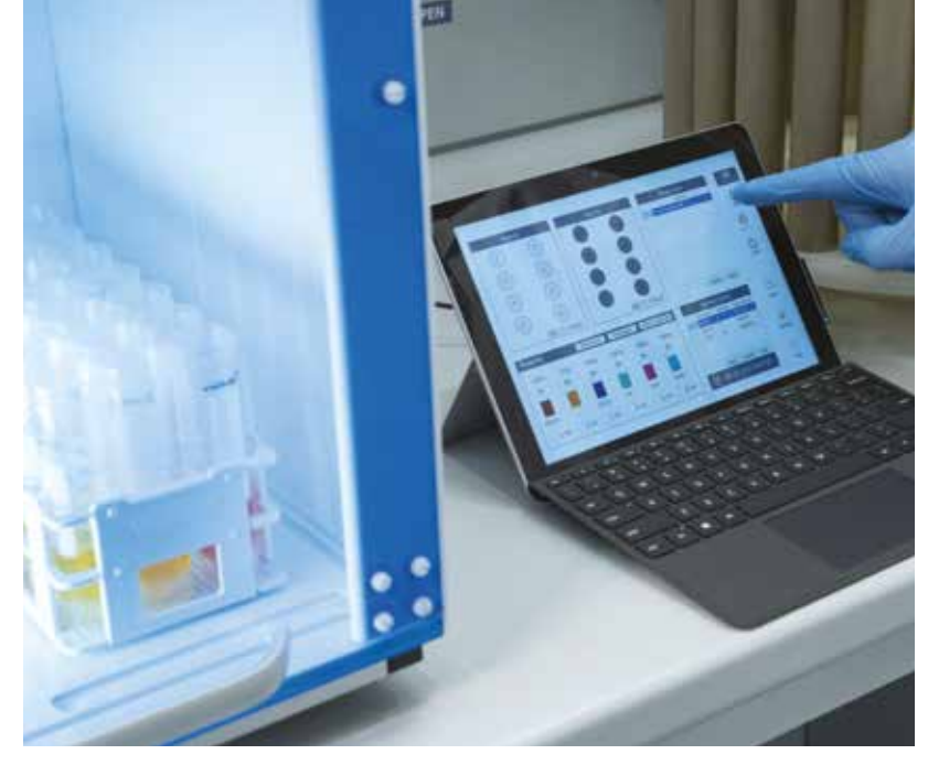
Automatic pre-dilution in 50-mL ICP autosampler vials

Additionally, the easyFILL enables predilution. At the completion of the digestion process, the solutions are transferred into volumetric containers and placed into easyFILL for automatic pre-dilution. This step is commonly done using ICP autosampler vials so that the operator has only to finalise the dilution and bring the solutions to the analytical equipment.